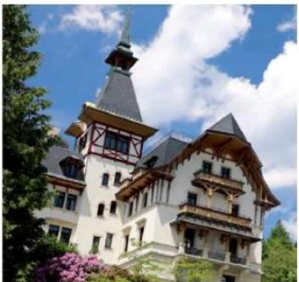
Top: at Paracelsus Recovery, the client count is always just one, hence the £90,000 fee. Above: Dolder Grand hotel, nearby, has a spa that clinic guests can use. Below: Lake Zurich

I have abused: too many hours working, too little good food. My heart is 'well preserved' and 'unremarkable'. Even when I pedal hard, my blood pressure and pulse barely budge. All those dog walks mean I've been doing something right.